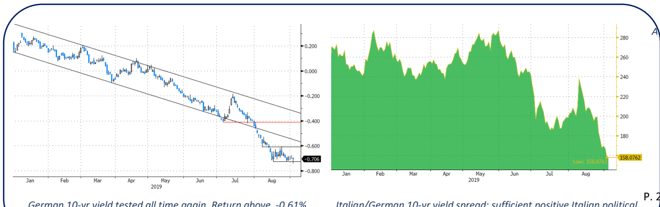
German 10-yr yield tested all time again. Return above -0.61% necessary to call off downside alert.

We hold our view that one of two things is necessary to end the upleg in core bonds: a sustained improvement in eco data and/or clarity on future EMU/US monetary policy. September ECB (12) and Fed (18) meetings will probably lock/shape policy for several months ahead. Markets expect (at least) rate cuts from both. The German 10-yr yield last & this week tested the all-time low (-0.73%). A return above first minor resistance (-0.61%) is necessary to call off the downside alert. Similar resistance for the US 10-yr yield kicks in around 1.6%. On the downside, key levels are 1.44% (2019 low) and 1.32% (all-time low).